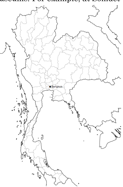
Figure 1. Location of Lopburi.

This fieldwork excursion's main purposes were to learn the Thai language, visit museums and archaeological sites, and decide upon an appropriate research field. As a result, I selected the Phromthin Tai site (Picture 2), located in a suburb of Lopburi (Fig. 1), as my research field.