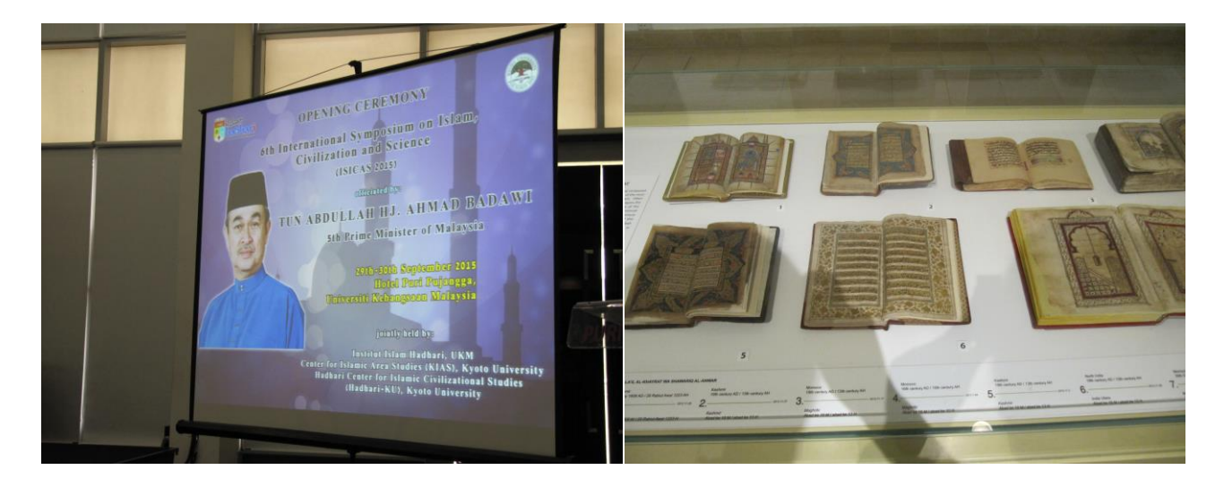
International Symposium at Universiti Kebangsaan Malaysia (UKM). I was able to conduct interviews at the symposium.