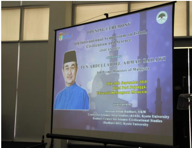
International Symposium at Universiti Kebangsaan Malaysia (UKM). I was able to conduct interviews at the symposium.