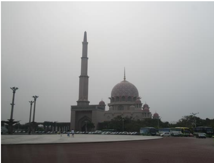
The Putra Mosque, Putrajaya.