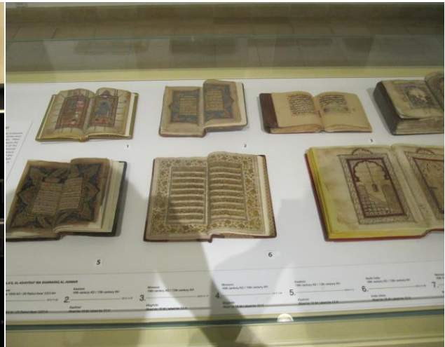
Old Qurans from various Islamic countries at the Islamic Art Museum, Kuala Lumpur.