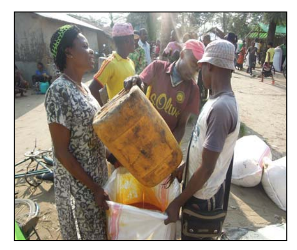
Fig. 3. Palm oil brokerage

During the investigation, I observed an expansion of periodic riverside markets in lieu of a land distribution system. The war destroyed the colonial distribution practice that had been sustained by expatriate companies. Therefore, local people have had to organize an alternative distribution system themselves. Local farmers transport their agricultural products to market by foot or bicycle. Petty traders then purchase the local farm produce in the markets (Fig. 3), and ship it to urban areas, using traditional dugout canoes, (Fig. 4). Today, a mass of people attend the markets as the main mechanism for urban-rural commodity interchange. The collapse of the pre-conflict distribution system has caused the markets to become influential regional economic nodes.