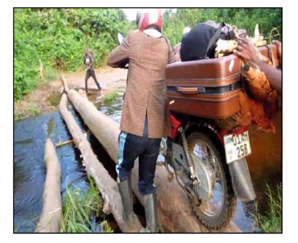
Fig. 1. Collapsed bridge

Repeated conflicts have plagued the Democratic Republic of the Congo (DR-Congo). The Second Congo War in 1998 included 19 countries and caused the deaths of 5.4 million people. Although the conflict ended in 2003, a state of war persists along the eastern national border of Orientale Province. Antigovernment forces periodically raid local villages and exploit mineral resources in an extensive area. The conflict has also devastated the distribution infrastructure, such as roads and bridges (Fig. 1), which has stymied the rural economy. Today, using rural tracks to travel to sell goods has become impossible, due to bridge collapses. Further, rural residents have lost outlets for their agricultural products. According to Kimura et al., (2012), local people have adjusted their subsistence strategies to compensate for the lack of truck trading. Since the end of the Second Congo War, local people have engaged in long-distance peddling to obtain cash income and imported merchandise (Fig. 2). While his study revealed local people's adaptation to the post-conflict situation, little research has been done to explore specific livelihood and distribution processes since the conflict. Thus, the current state of urban-rural distribution remains unclear.