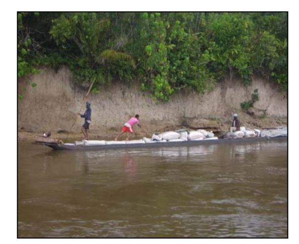
Fig. 4. Shipping by canoe

Implications and impacts on future research