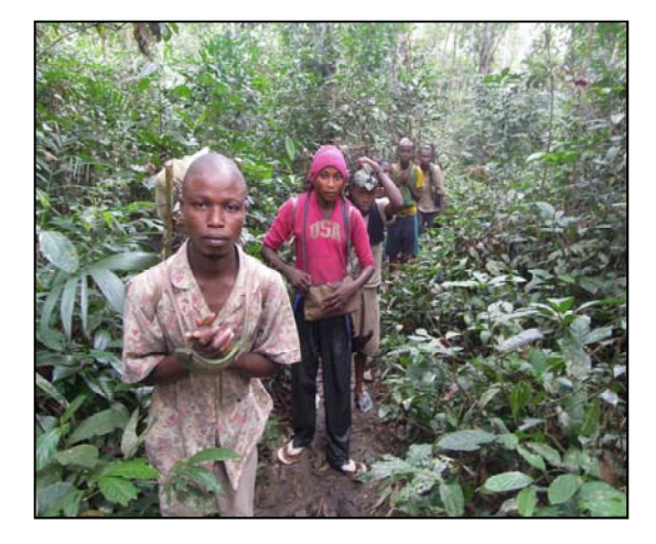
Fig. 2. Long-distance peddling