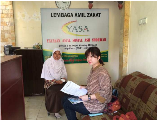
↑ YASA's office (Malang, August 8, 2014)