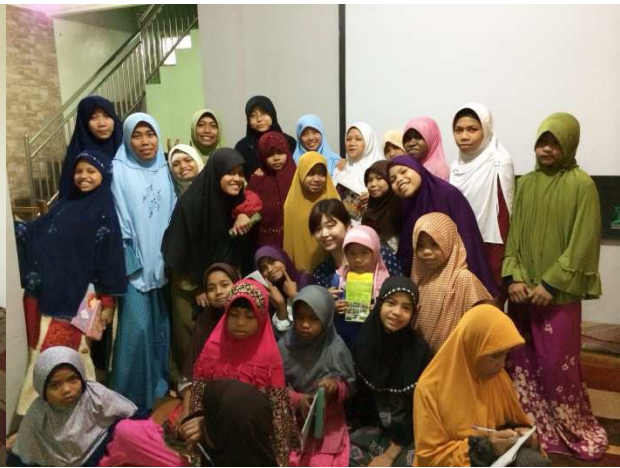
↑ Orphanage run by YASA(Malang, August 20, 2014)