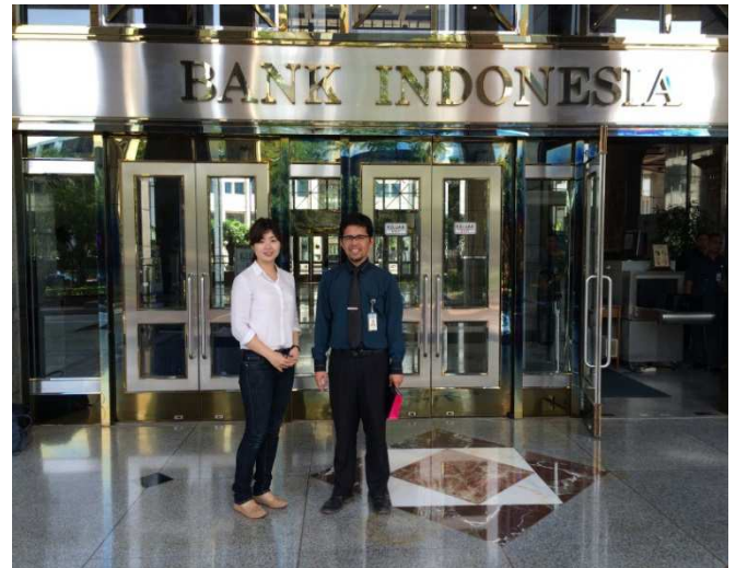
↑ Bank Indonesia (Jakarta, September 22, 2014)