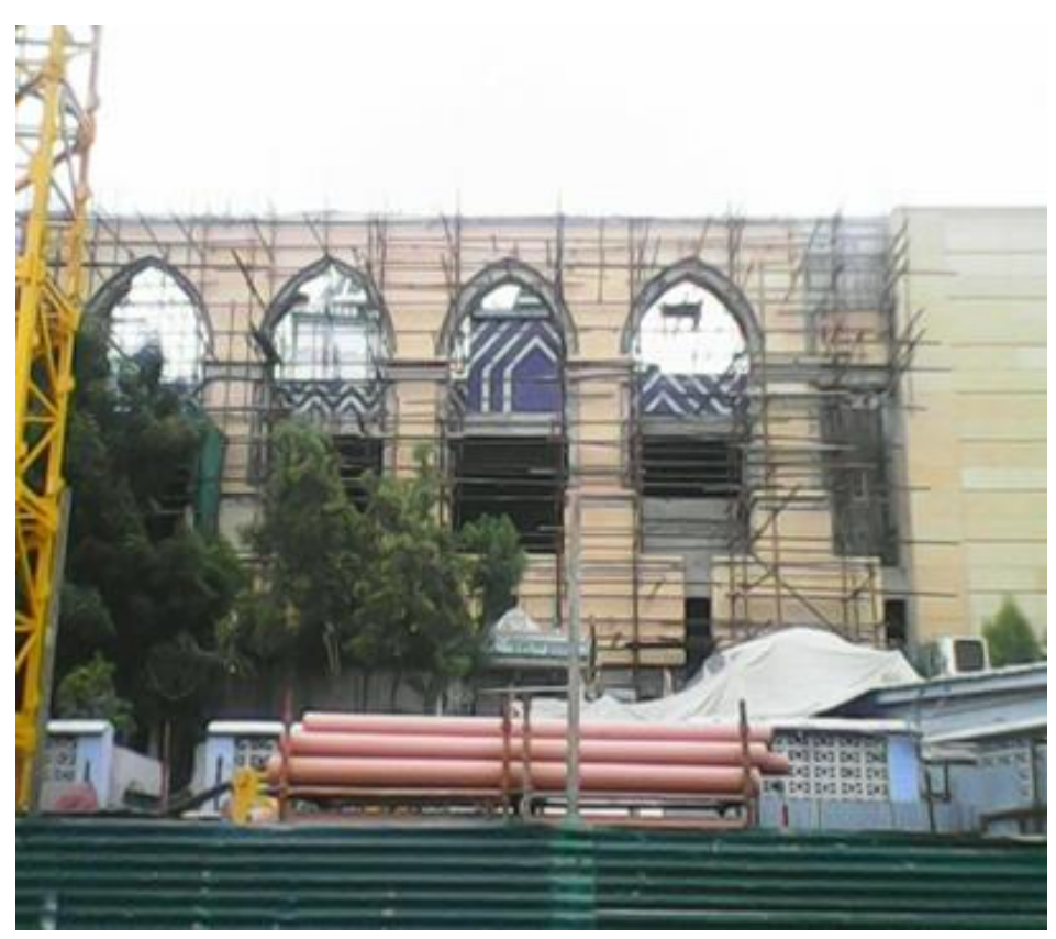
Shrine of 'Abd Allāh Shāh Ghāzī