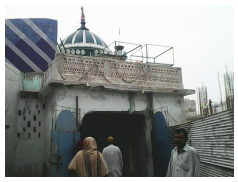
Entrance of the shrine of 'Abd Allāh Shāh <u>Gh</u>āzī in Karachi.