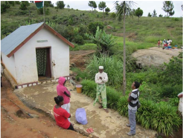
Mpiandry and worshippers in front of a doany