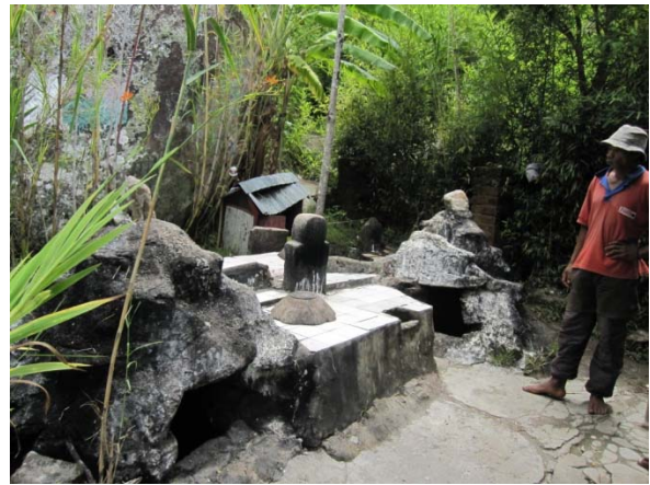
Doany for a safe delivery and healthy baby