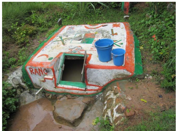
Doany of the source of water