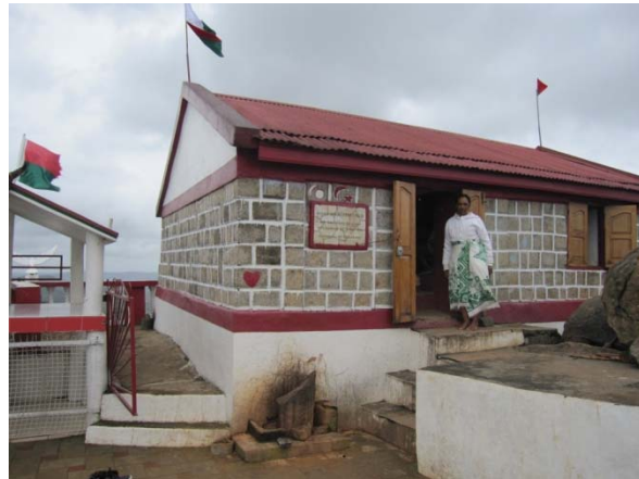
Doany Mangabe, one of the famous sacred places