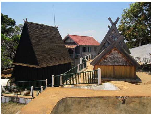
Royal palace and tombs in Ambohimanga

Although doanys were initiated by the Merina people, doany worship has become widely adopted among people from the islands of the West Indian Ocean, stretching beyond ethnic barriers and national borders through a kind of spirit possession ritual named " tromba ."