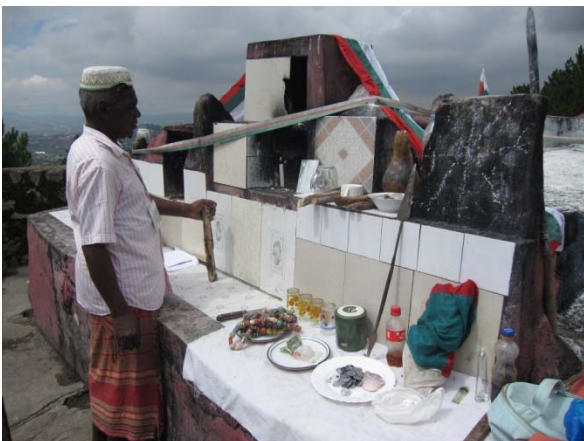
Mpiandry praying at an altar

It would be interesting to extend our study of religious activity with doanys to other areas and compare them with Ambohimanga.