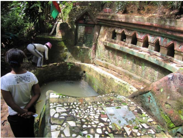
Doany that was built 30 years ago by the Order of the Spirits