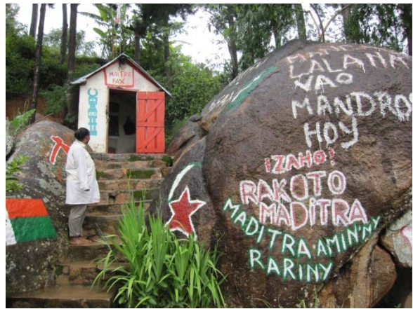
One of the doanys in Ankazomalaza