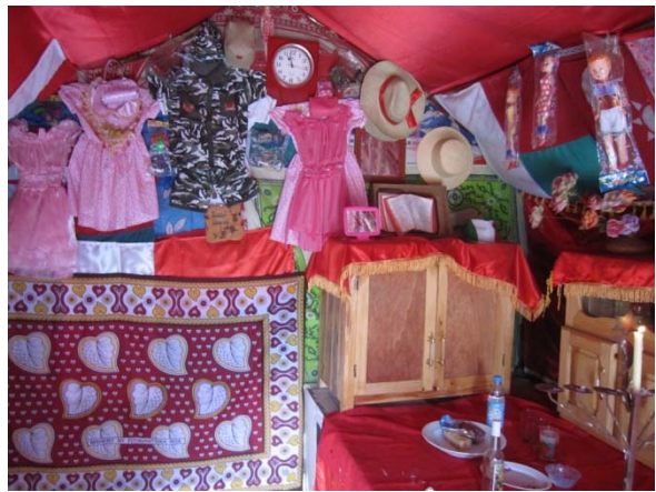
Altars are different in every doany