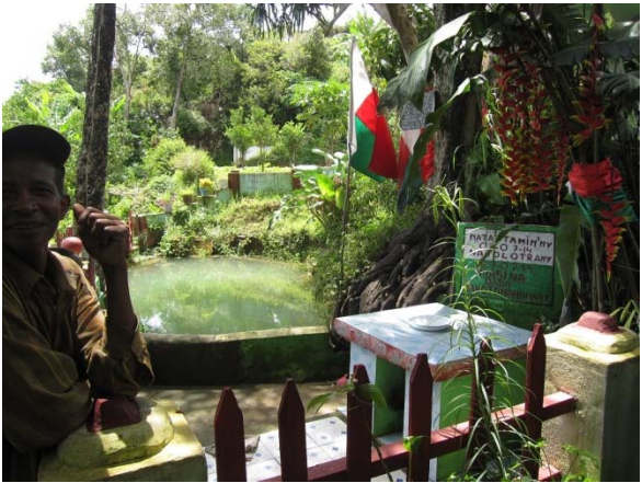
Sacred pond and altar