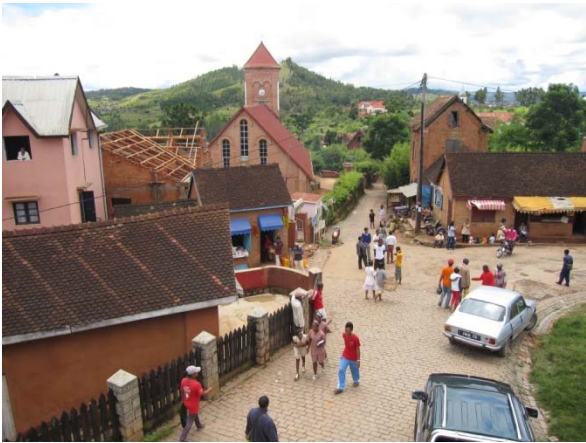
Main street of Ambohimanga village