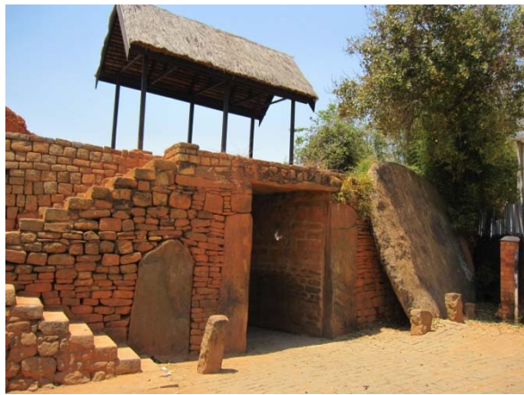
One of the gates of Ambohimanga