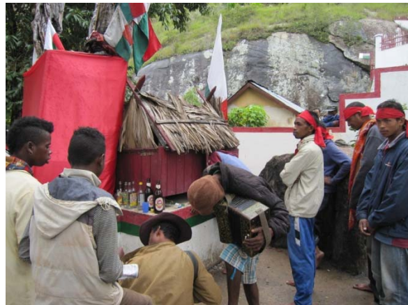
Scene of tromba in Ambohimanga