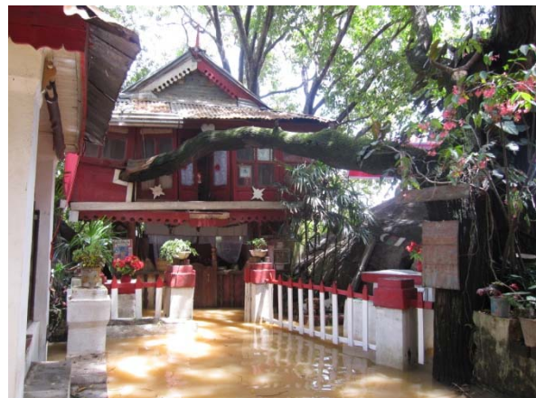
Doany Andranoro, one of the famous sacred places