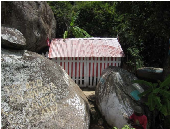
New building built by the Order of the Royal Spirit