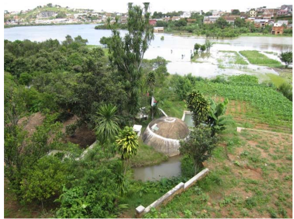
Doany that enshrines a huge stone