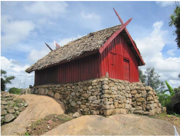
One of the doanys in Mahazaza