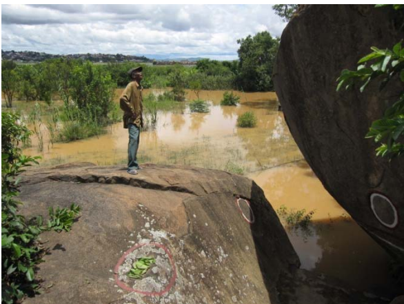
One of the places of worship