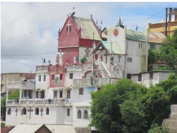
Doany compromising with Christianity