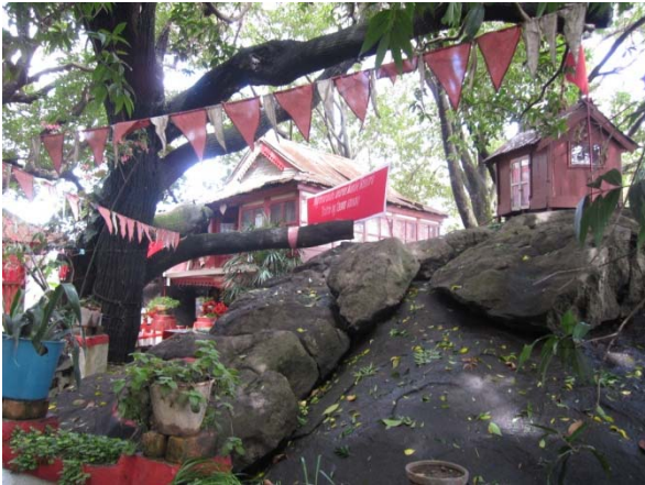
Doany with an Asian air