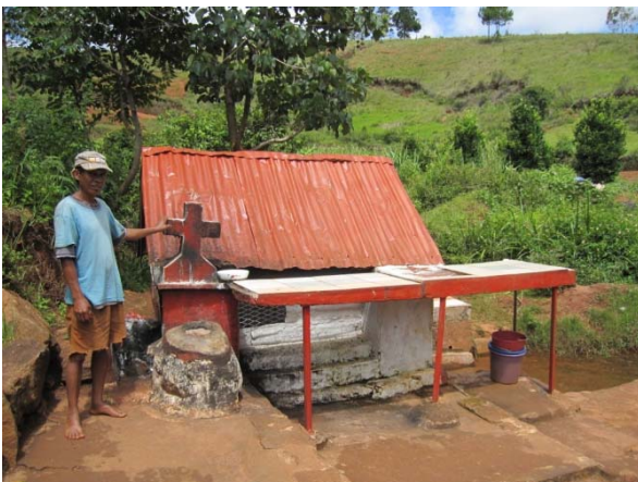
Doany which was built on a sacred well