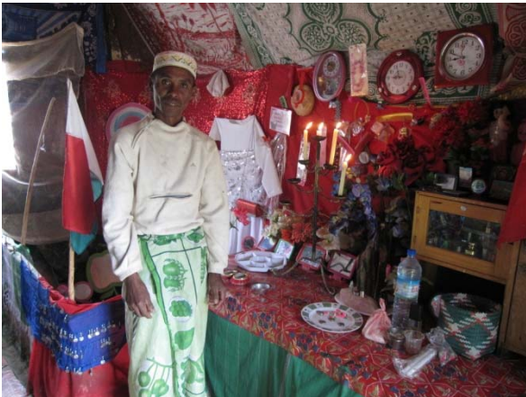
Inside a doany , an altar with mpiandry