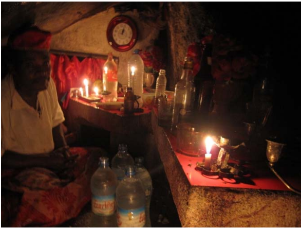
An altar enshrined in a cave