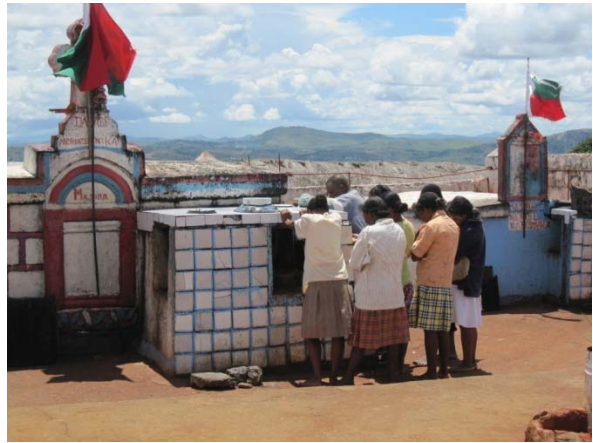
Pilgrims at a doany