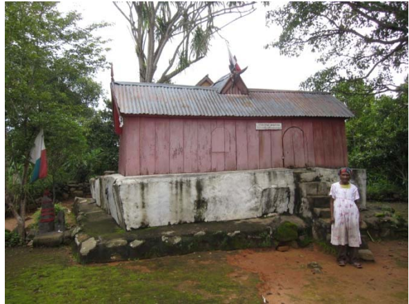
One of the doanys in Amboatany