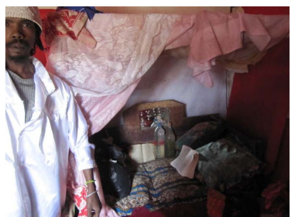
Relaxing space of the Royal Spirit