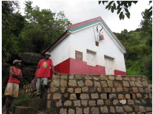
One of the doanys in Ambatondradama